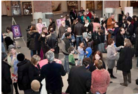
Artists, art lovers and supporters of Ravenswood Elementary School celebrated the success of the Pink ArtWalk at Architectural Artifacts.