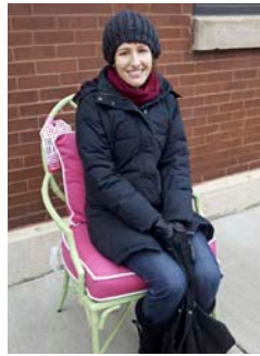
The lucky winner of Sunbrella fabric-covered Century chair.