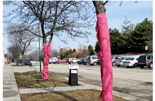
Sunbrella's 50th Anniversary "Canvas Hot Pink" fabric decorated Ravenswood trees.